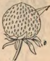
Fig. 12. STRAWBERRY.

But the study of fruits from the botanical side presents us with a highly interesting illustration of the value of "homology," as showing us how the modification of simple and well-known parts of the flower may become transformed so as to be well-nigh unrecognisable in the fruit. No better illustration of the latter fact can be found than in the Strawberries (Fig. 12), which secured the full admiration of Dr. Boteler, who declared that "Doubtless God could have made a better berry, but doubtless God never did"—a remark the correctness of which will probably be viewed proportionately by the individual minds and tastes which may consider the saying. Glancing at the Strawberry flower, we see no promise therein of the toothsome fruit which the summer brings; and we may well be puzzled to discover the true nature of our berry, even after a close examination of its substance. The apple cut across is seen to contain seed—therefore we may reasonably enough imagine that, whatever growth has subsequently occurred to the apple blossom, we find the seed-producing pistil of the flower to be represented in its interior. But no seeds are to be found in the interior of Dr. Boteler's berry. Where, then, is the true fruit—the ripened pistil—of the Strawberry, and what is